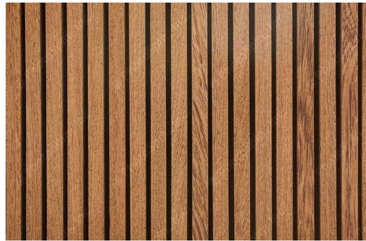
T ALUMINIUM TIMBER BATTENS, OR SIMILAR