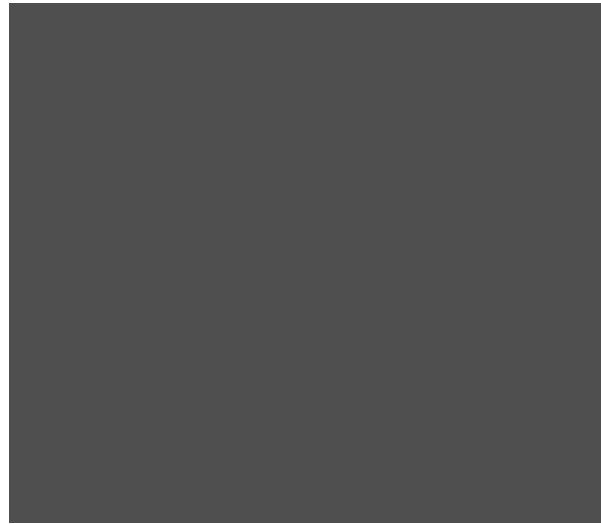
R1 MONUMENT DULUX, OR SIMILAR