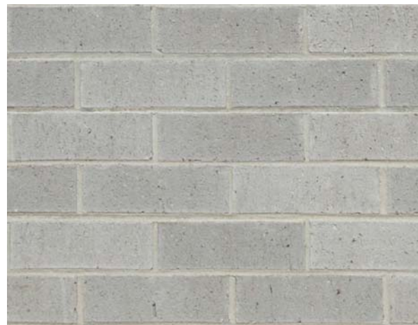
BK PHG BRICKS - DARK & STORMY, LIGHTNING, OR SIMILAR